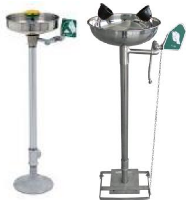
Model # D/SE/SS-E150/B